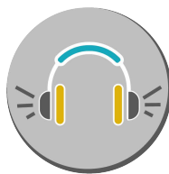
Audio Narration and Editing